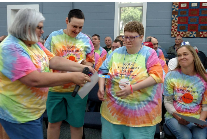
God's Treasures Camp brings joy to the Lake Huron Retreat Center.

With a deep commitment to the ongoing mission of Christian Camping and retreat ministries, the Michigan Area United Methodist Camping Board of Directors voted Feb. 18, 2019, to suspend operations at three summer camp sites and one RV campground for the 2019 season.