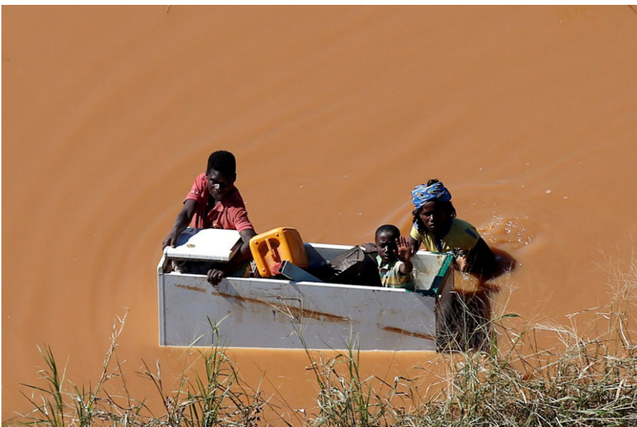
A child is transported inside an empty refrigerator during floods after Cyclone Idai, in Buzi, Mozambique. Gifts to UMCOR’s International Disaster Relief #982450 will help meet basic human needs of those affected in Mozambique, Zimbabwe and Malawi.

“So far two truckloads of needed items has been dispatched to Mutare,” Gurupira reported. “The consignment included maize meal, cooking oil, water purification liquids, clothes and blankets.” The church also is making a guesthouse at Isheanesu Children’s Home available as housing for 20 doctors offering free service in the affected areas.