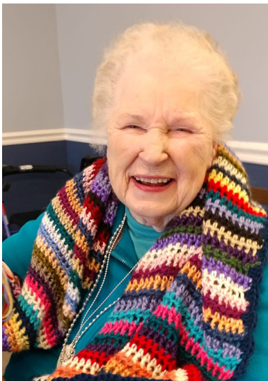
GREATER SOUTHWEST DISTRICT... This lovely prayer shawl brings a big smile to a beloved member of the Otsego UMC family.