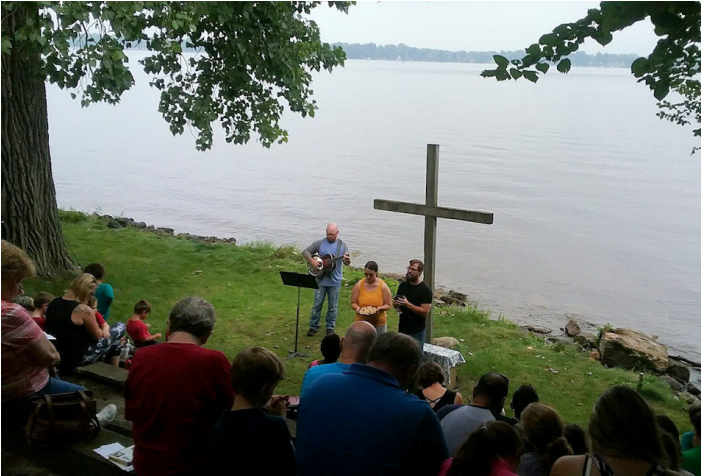
Campers at Judson Collins Center participate in worship at the lakeshore.