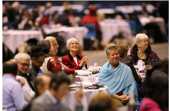
Michigan delegates, seated in the center of the plenary floor, participate in the opening day of prayer on February 23, 2019 in The Dome.

Seven major newspapers across the state published The Michigan Statement on Sunday, March 17. This "letter to our