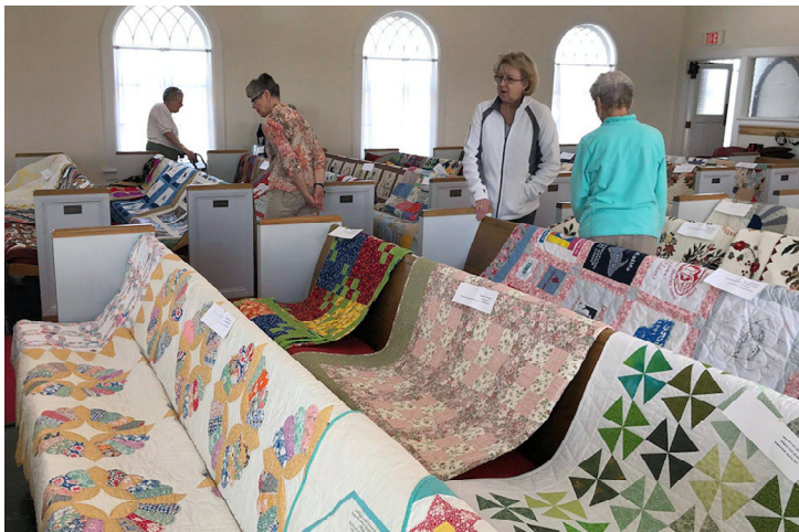
MICHIGAN MINISTRIES... Chelsea Retirement Community residents shared a wealth of memories when 77 quilts were on display at the Chelsea Retirement Chapel.