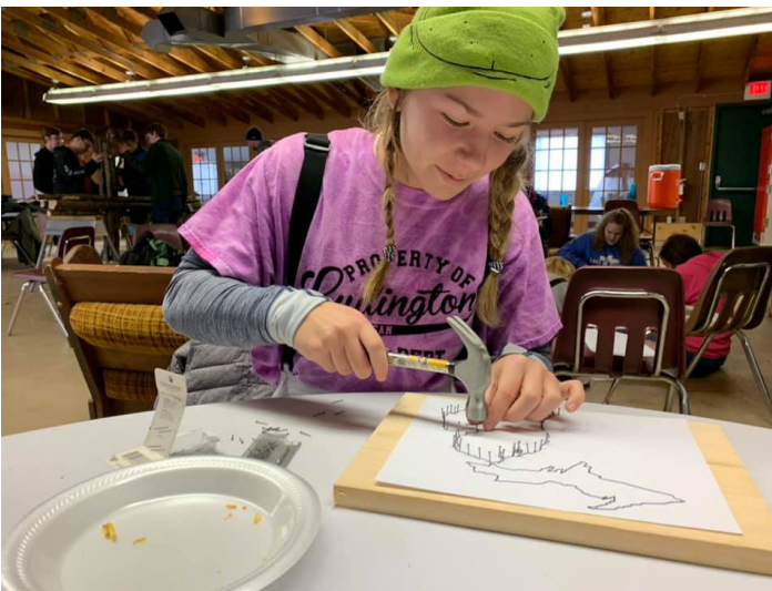
Lake Michigan Camp and Retreat Center's doors are open to people of all ages all year.