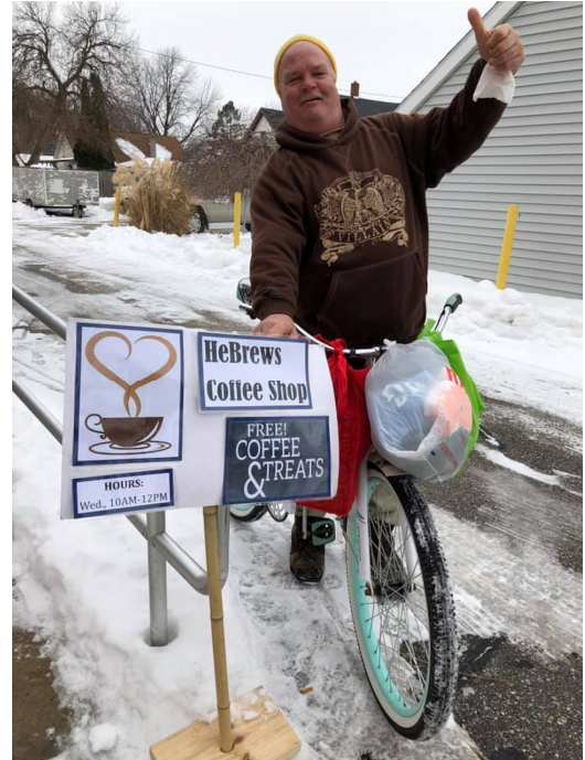
CENTRAL BAY DISTRICT ... Thumbs up for HeBrews Coffee Shop hosted by New Heart UMC. Free coffee and treats on Wednesday mornings. Sweet!