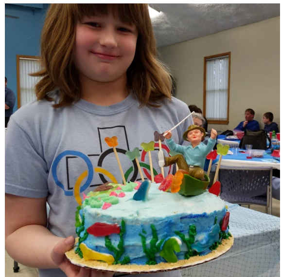
MID-MICHIGAN DISTRICT ... Sycamore Creek/ Pottsville holds an annual cake auction that sends kids from the congregation and community to camp. Summer is coming!!