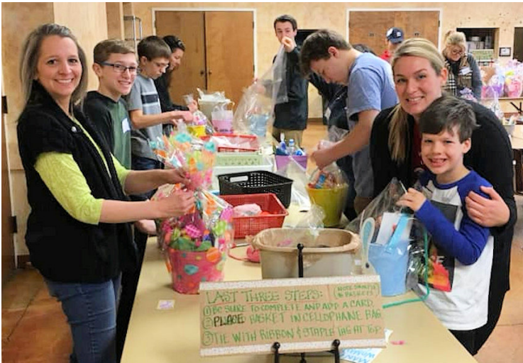
EAST WINDS DISTRICT ... Lake Orion UMC fills “Resurrection Baskets” with comfort items, snacks and love to distribute on the streets of Detroit before Easter.