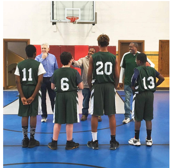
MICHIGAN MINISTRIES ... More March Madness!! Did you know that the Methodist Children's Home Society had a basketball team? Yes, they do! Meet the MCHS Hawks.