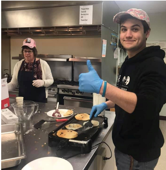
NORTHERN WATERS DISTRICT ... PHAT Tuesday (Pretty Hot And Tasty) at Grayling: Michelson Memorial UMC. Proceeds from the dinner supported the youth group.